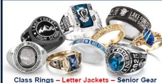
Class Rings - Letter Jackets - Senior Gear

Promotion Code: SENIORGIFT40 (some exclusions apply)